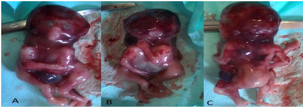
Figure 1. A. Normal face with two eyes, one complete nose and one mouth, and one set of low set ears; B. Incomplete facial features as one cyclopic eye and irregular fused nares and mouth orifice; C. The arms and legs of each of the twins were of similar length and development and followed the orientation of the spine

patient was referred to a tertiary health center, (Yas Hospital, Tehran, Iran), for further evaluation. The next ultrasound exam was performed at 13-14 weeks of pregnancy. Unexpectedly, two alive fetuses were reported fused in head, thorax, and abdomen. The ultrasound diagnosis of cephalothoracopagus CTs was made. Because of the poor prognosis, counseling was provided for parents and elective medical pregnancy termination by misoprostol was carried out. The expelled twins were fused at the cranium, thorax, and abdomen to the umbilicus. Twines had a shared placenta and umbilical cord. The faces were dissimilar and on opposite sides of the head, 90 degrees to the separate spines. There was one normal face with two eyes, one complete nose, and one mouth, and one set of low-set ears (Figure 1A), and the opposing face had incomplete facial features as one cyclopic eye and irregular fused nares and mouth orifices (Figure 1B). The arms and legs of each of the twins were of similar length and development and followed the orientation of the spine (Figure 1C). The twines' sex was not obvious but more likely were females.