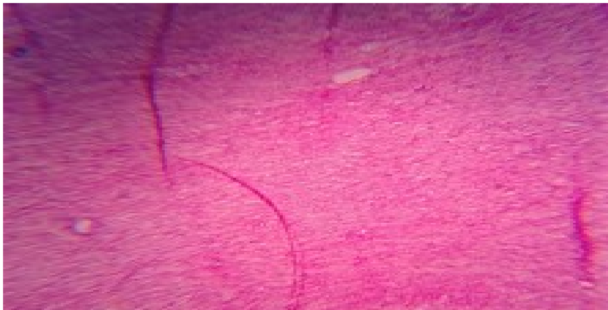
Figure 2. b: Photomicrograph of Leiomyomata with ischemic necrosis